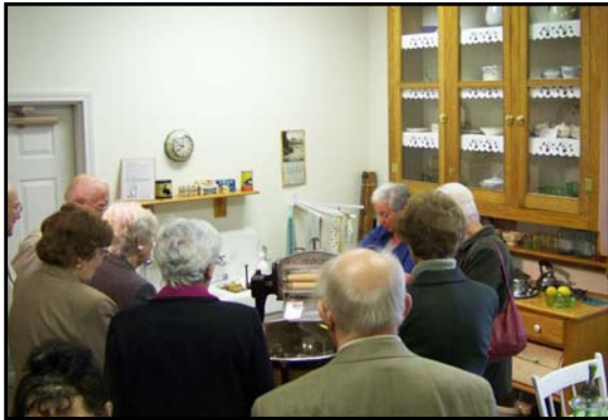
Chili Historical Society Tours 1930's Kitchen Exhibit