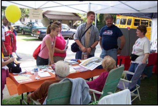
Greece Historical Society Booth At Hilton Apple Festival