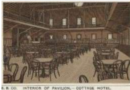
E. B. CO. INTERIOR OF PAVILION, - COTTAGE HOTEL.

AMUSEMENTS. This open house to HOTEL, ONTARIO Pavilion. All amusements on the Beach will be here continued during the season. ONTARIO PAVILION WE SING SUNDAY AFTERNOON AND EVENING CONCERT BY 54th Regiment Band ROCHESTER MANNER CHOR Grand Kirmess AT ONTARIO BEACH PAVILION, CHARLOTTE ON THURSDAY EVENING, JUNE 24, 1896 THE BEACH AT CHARLOTTE. Special to introduce to Wash. 1077818 WASH. MESSIAH and Grand Pavilion APPROXIMATELY 10:00 AM TO 10:30 PM