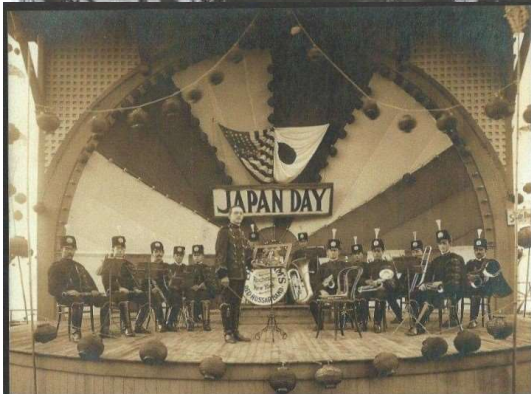
Band Stand Ont. Beach Pk. Lapham's "Red Russes" Band - Japan Day, 1910